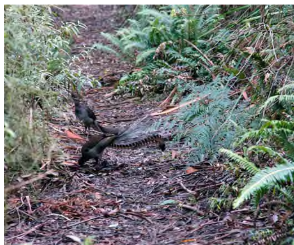
Lyrebirds on the Thornton Walking Track

Come and join in on Monday, the 5 October, at 9:30am to 12:00 Noon