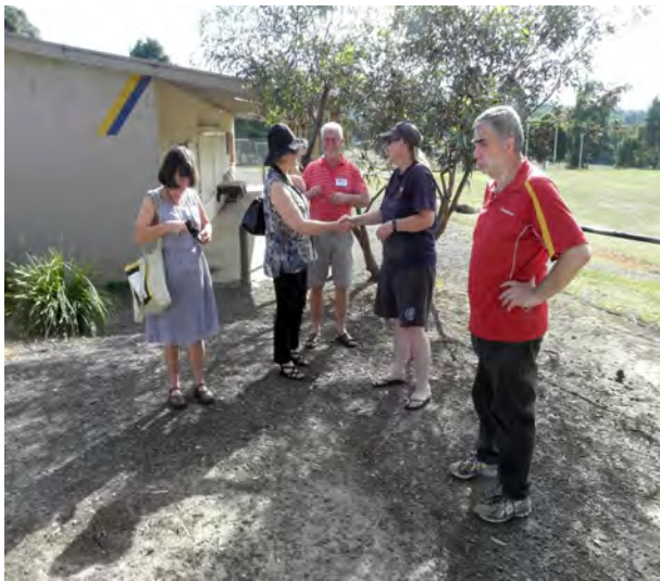
Getting ready for a walk around the oval

WHYLD is an acronym that stands for the towns of Woori Yallock, Hoddles Creek, Yellingbo, Launching Place and Don Valley. All residents of these towns are considered to be part of WHYLD. The WHYLD community group have been around for a few years now, and their vision is to unite these five small towns to form a larger and more connected community. WHYLD have facilitated a number of free local events aimed at bringing residents together, such as WYTAG Garage Sale, Woori Open Day, Winter Warming, Woori Kid's Fest and Camelot Castle Medieval Village Fair.