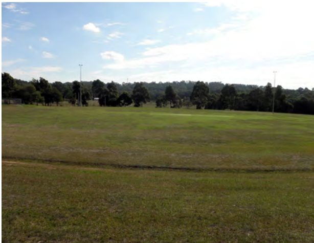
Views from the oval