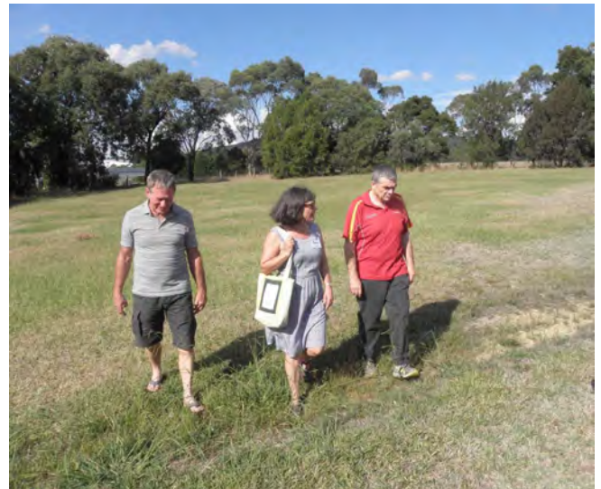
Walking round the oval