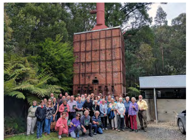
Group photo in front of the kiln