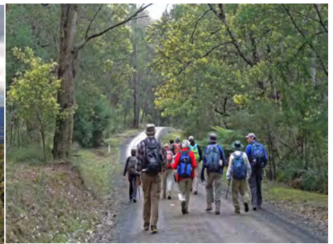
Enjoying the scenery the flora & fungi