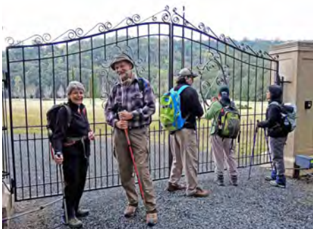
Looking through the gate at an interesting property on Soldiers Road