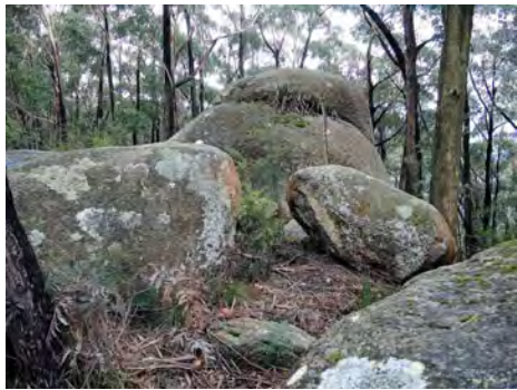
Some of the rocks at the Fire Tower