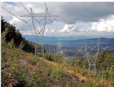
The views from the Powerlines