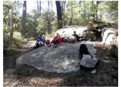
Found a good spot in the sunshine