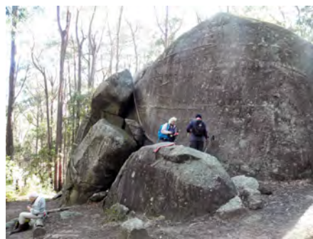
Finding a place for morning tea