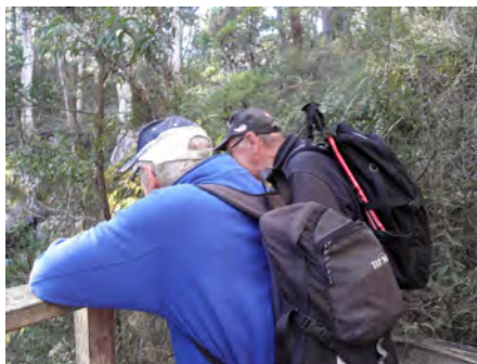
Admiring the Waterfall