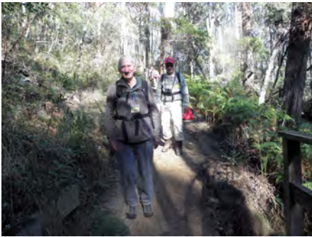
Walking down to the viewing board

At Shiprock Falls we walked down to the Waterfall admired the huge rock and little groups could be found everywhere enjoying their morning tea.