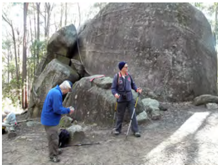
Searching for a good spot